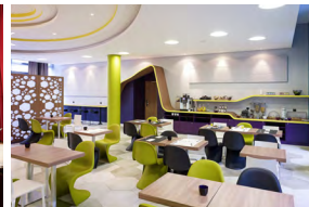
KÖLN CITY GERMANY