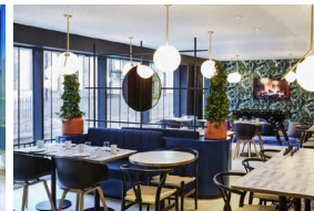
EDINBURGH ROYAL MILE U.K.