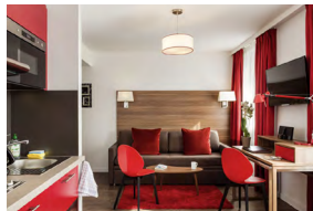
PARIS COURBEVOIE FRANCE