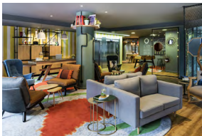
PARIS BERCY VILLAGE FRANCE