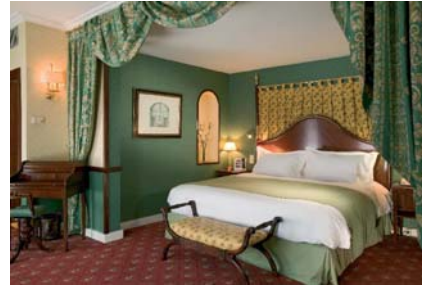
Mercure Madrid Plaza de España: -20%