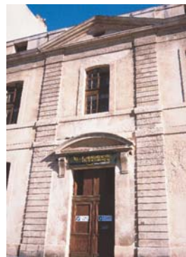
Etap Hotel Marseille Vieux Port : - 15%