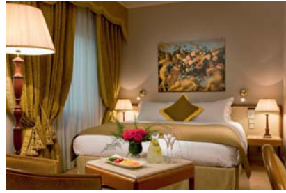
MGallery Cerretani Firenze:- 30%