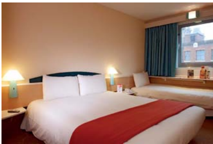
ibis London City: - 20%