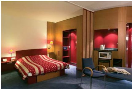
Suitehotel Genève: - 30%