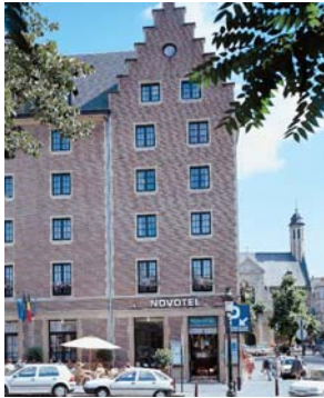
Novotel Brussels Off Grand'Place: - 30%